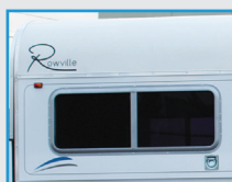
Sliding Side Windows