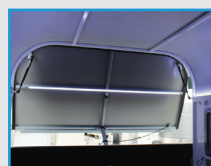
Barn Door *Optional