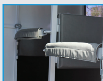
Adjustable Chest Bars