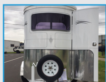
1x PA Door