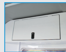
Enclosed Front Rug Rack