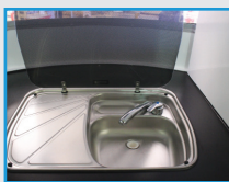
Sink & Water Tank