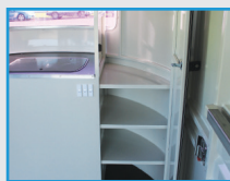
Full Height Wardrobe