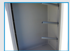
Swing-out Tack Box (can stay outside)

This model also comes standard with: Front Head Divider / Low Side Step / 2x Sliding Drop Windows / 1x Side Rump Window / 2x roof vents / Breakaway / 1 tack door / swinging head divider between bays / 2 TONE PAINT