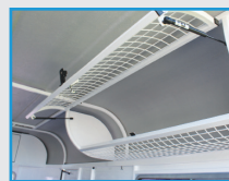
Enclosed Side Rug Rack