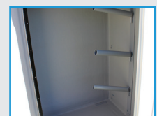
Swing-out Tack Box (can stay outside)

This model also comes standard with: Front Head Divider / Low Side Step / 2x Sliding Drop Windows / 1x Side Rump Window / 2x roof vents / Breakaway / 1 tack door / swinging head divider between bays