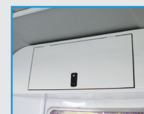
Enclosed Front Rug Rack