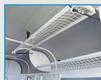
Enclosed Side Rug Rack