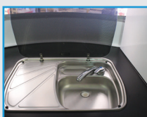
Sink & Water Tank