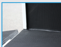
Anti slip rubber floor