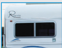
1x Sliding Side Rump Windows