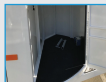
3/4 Tackbox with 1x Door