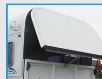
Lift Up Door