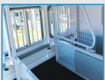
FlexiTravel Adjustable Dividers