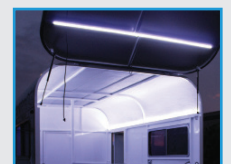
LED Internal Lighting

CALL TODAY (03) 9775 0456 17-19 Sonia St, Carrum Downs, Vic 3201 | www.rhta.com.au