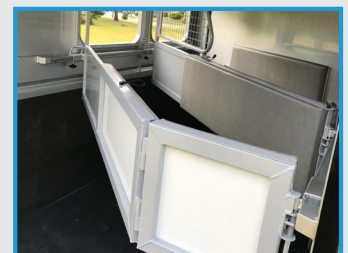
FlexiTravel Adjustable Dividers

CALL TODAY (03) 9775 0456 17-19 Sonia St, Carrum Downs, Vic 3201 | www.rhta.com.au