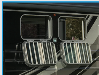
Sliding Drop Down Windows