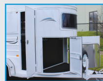
Tackbox with 2 xTack Doors