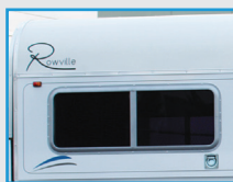
Large Side Windows