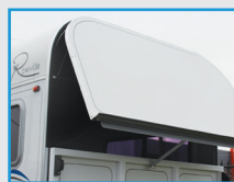
Lift Up Door