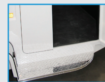
Low Side Steps

This model also comes standard with: 2x roof vents / breakaway.