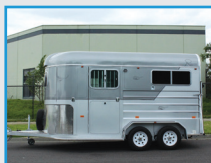
Prestige Side Shot