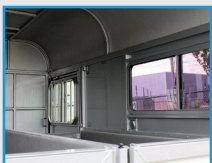
Big bright fly screened windows

* Ask us about our Prestige Dressing Room Upgrade Pack!