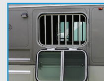
Side step & drop down window on door