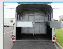
Rear breaching gates and barn door