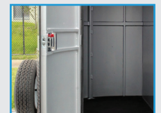
Large Tack & Dressing Room at front

**Two tone paint and Painted Roof optional extra