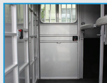
Generous space in front of the horses